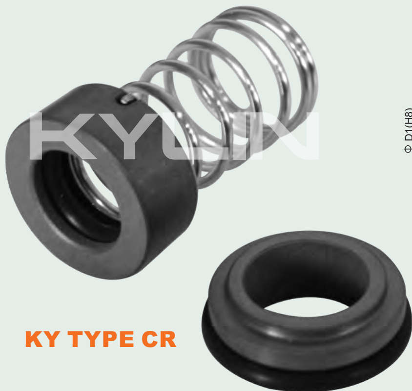
KY TYPE CR