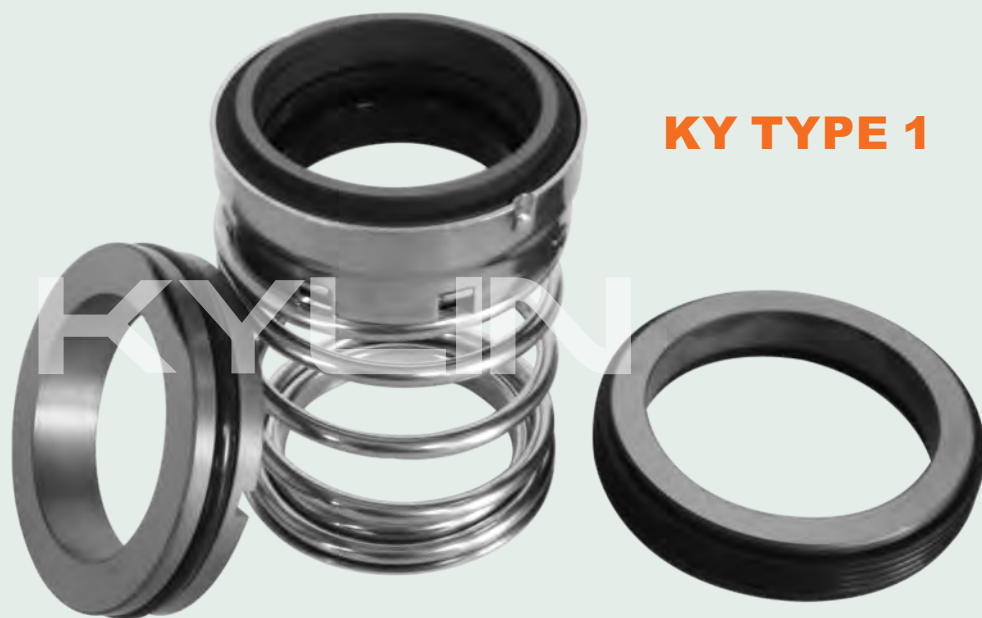
KY TYPE 1