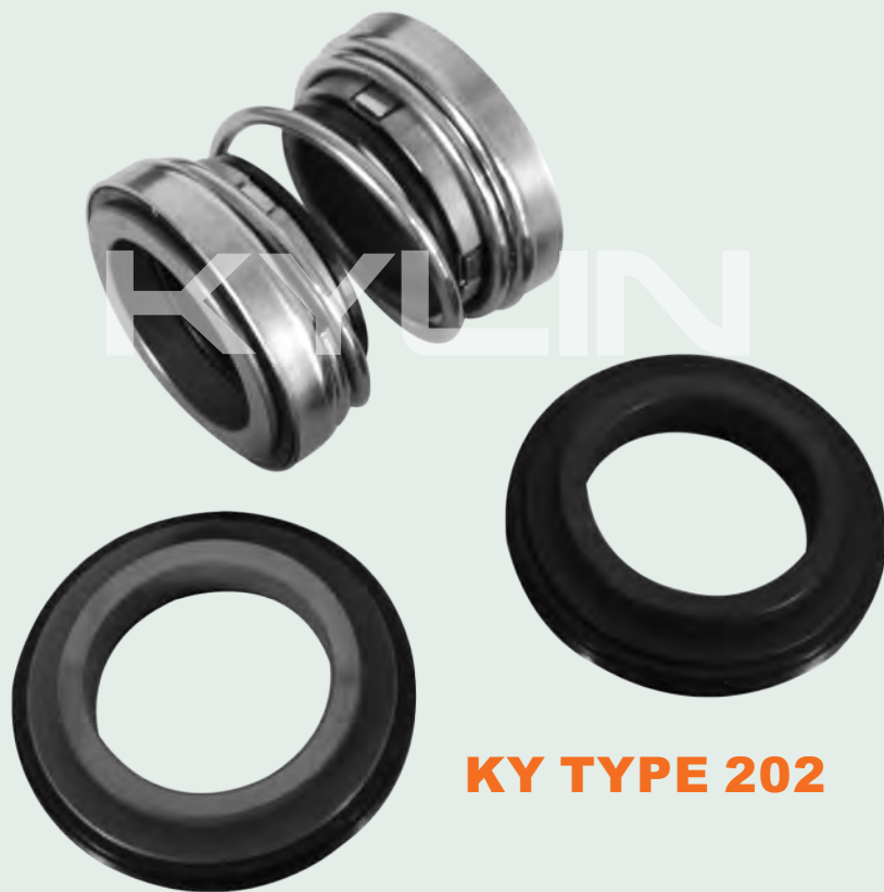
KY TYPE 202