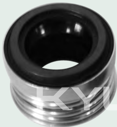
KY TYPE 16