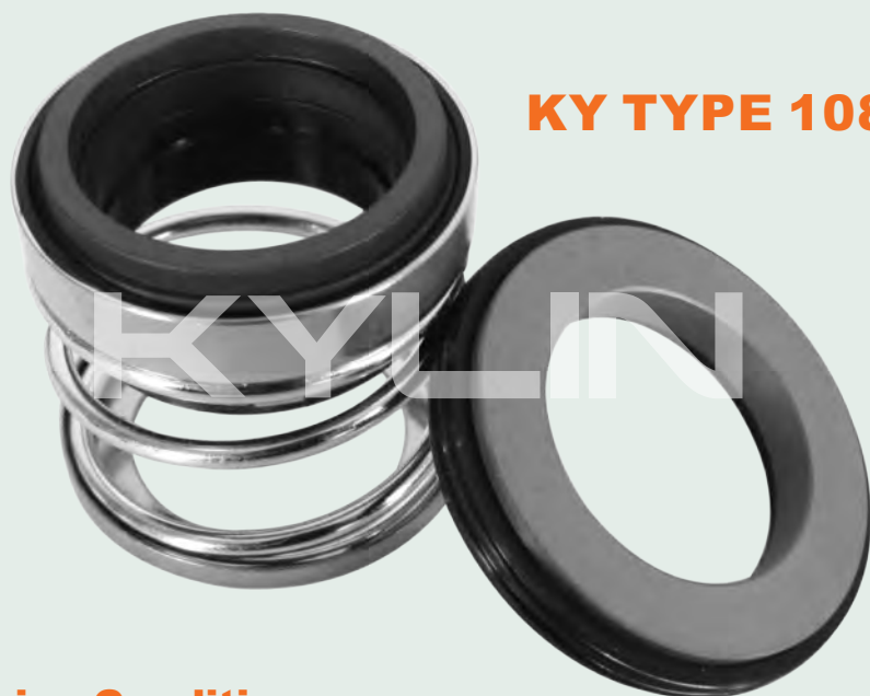
KY TYPE 108